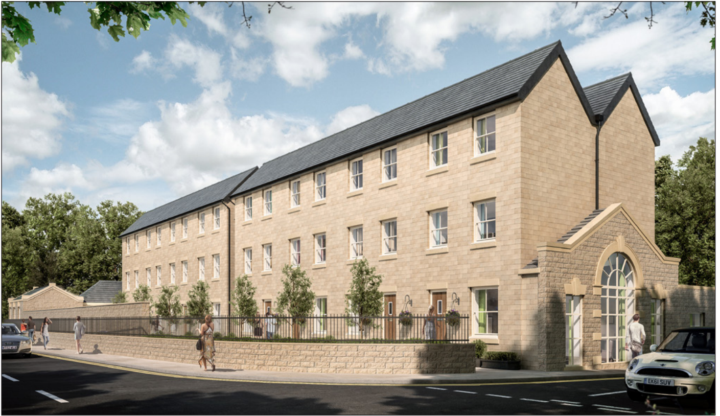
Artists impression of proposed development - Andrew Street frontage