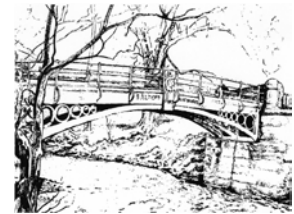
Iron Bridge Restoration Project